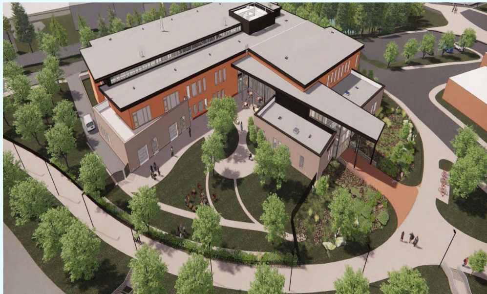
HSC II Lambs Lane Campus