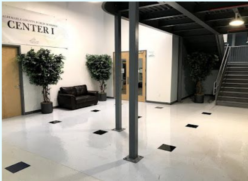
HSC I 1180 Seminole Trail, Suite 225