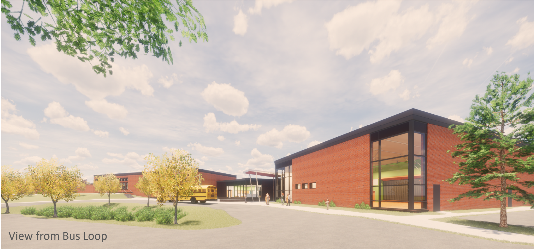
View from Bus Loop